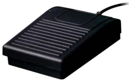
Figure 1: Liposat® / Vibrasat® footswitch (1-pedal)

The devices can be started and stopped by pressing the button.